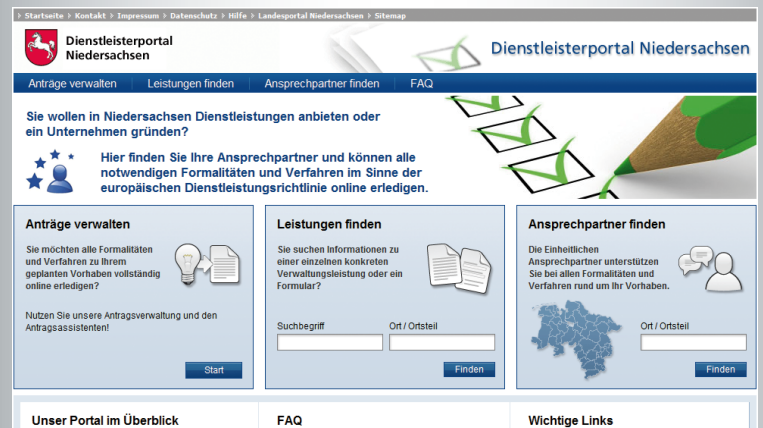
Lower Saxony service portal

"Thanks to the quick implementation of the required specialist application we were able to fulfil the EU requirements and offer the service to schedule".