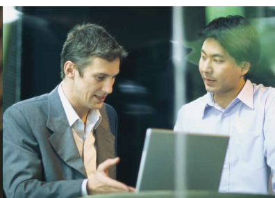
October 2009 Acceptance of specification and beginning of implementation