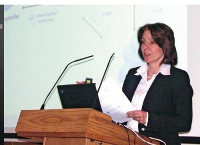
28 December 2009 EU service provider portal goes into live operation