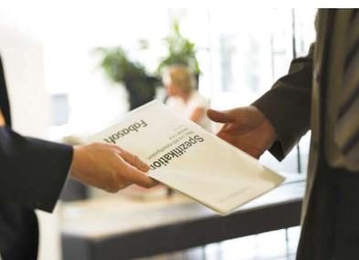
September 2009 Fabasoft appointed to implement the customised application