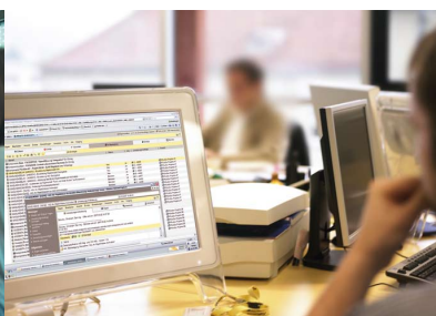
11/2008 ELAK upgraded to Version 7.0 SP1 of Fabasoft eGov-Suite