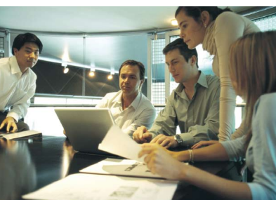
02/2005 Roll-out completed at the 12 federal ministries