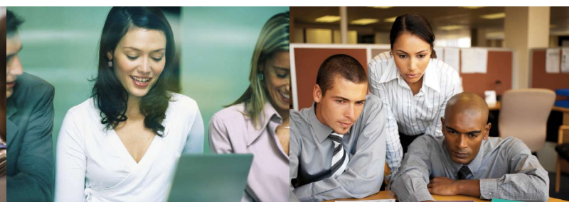
2009 Dual delivery and electronic signature available